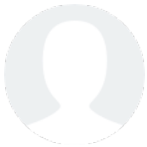
Christy Cotton COTTON REAL ESTATE